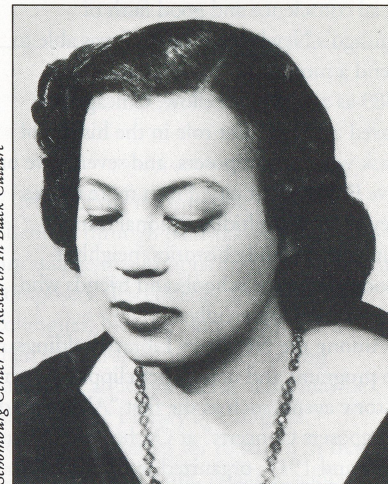
Schomburg Center For Research In Black Culture

Price's works are in a late Romantic style, reflecting the influence of her conservative New England Conservatory training and the advice of Antonin Dvořák to American composers to develop a national style through the use of native materials. The Sonata in E Minor, her major work for solo piano, illustrates her use of idiomatic Negro