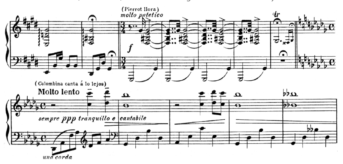
Example 3: Isasi, Carnaval, I. Canción a la Luna, mm. 76-87.

Evident immediately is that a kind of Commedia dell'arte narrative subtext is being played out. The melancholic music of "Pierrot" (the clown) uneasily shifts between various rhythmic underpinnings, seeming most comfortable in a kind of habanera, but eventually reaching an almost painfully dissonant climax, written in the score at this moment is the indication "Pierrot Ilora," which then limps into an indecisive trill. This entire episode is restated verbatim. Then, in a masterful stroke, Isasi introduces a new character, "Colombina," and the titular "song to the moon" is suddenly illuminated.