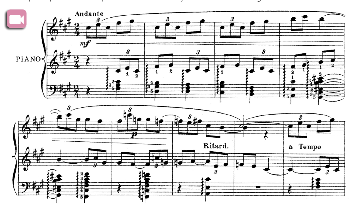
Example 4: Zubeldía, Esquisses d'une après-midi Basque, II. L'Écho dans la montagne, mm. 1-9.

It is perhaps the second piece that immediately stands out in this regard.