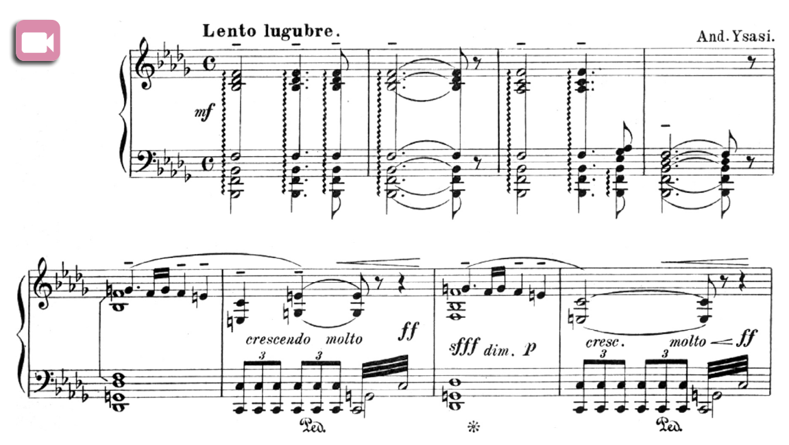
Example 1: Isasi, Marcha Funebre, mm. 1-8.

This piece opens with all the hallmarks of a character piece genre that is guintessentially Romantic: a dark, harmonically saturated pianistic tessitura, dotted rhythms immediately conjuring up the requisite funereal spirit, which later intensifies with rattling tremolo effects. However, the warm, unexpectedly "innig" quality of Isasi's lyricism and harmonic color in this essay is something that is elusive in the two most recognizable examples from the piano repertoire—Beethoven's Op. 26 and Chopin's Op. 35. Beethoven uses the movement as a chance to exploit orchestral sound effects, and Chopin reverts to his, undeniably beautiful, moonlit bel canto. No less striking is the way Isasi's later secondary dominant arrival at the relative major remains distinctive in expressive character while unmistakably echoing Chopin (measures 20–21). Throughout this episode as well as the larger canvas of the whole work, meticulously notated voice-leading and tracing of important inner contours seems to relate this music peripherally to the Continental examples Isasi admired. For example, the chordal spreads with which the "Piu Allegro, ma tranquillo" area closes are distinctly redolent of similar moments in the music of Liszt, such as the closing section of Un Sospiro .