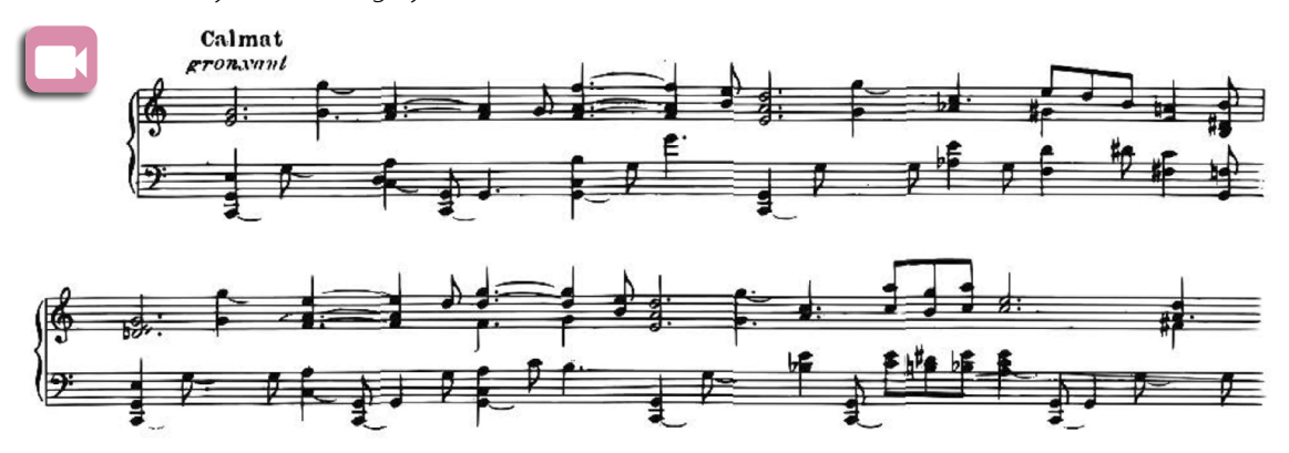
Example 6: Blancafort, Cants intims I, II. He anat a reposar a la platja i el cel era tot gris.

Of the sets in this particular album, and indeed of Blancafort's whole output for piano, is one which is particularly full of treasures: Cants íntims. This set immediately reflects the composer's introverted, withdrawn "tendency to melancholy" (Villalba 2004) as well as Blancafort's self-proclaimed inspirations as a composer: "He wrote most of his early works after returning from long days spent in the mountains, in sunshine, wind, fog or rain" (Villalba 2004). In each of these pieces a high criterion is placed on lyricism. Blancafort eschews the overladen chromaticism and contrapuntal excess of his immediate predecessors as well as the objective, mathematical lab-work of early contemporaries. A piece in which all of these qualities are immediately evident is second from the set, He anat a reposar a la platja i el cel era tot gris (I went to the beach to relax and the sky above was grey).