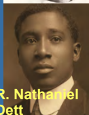
R. Nathaniel Dett