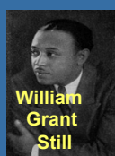
William Grant Still