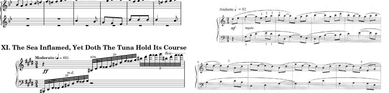
Orrin and Echo (1970)